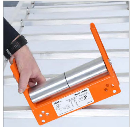
1. Drop over.