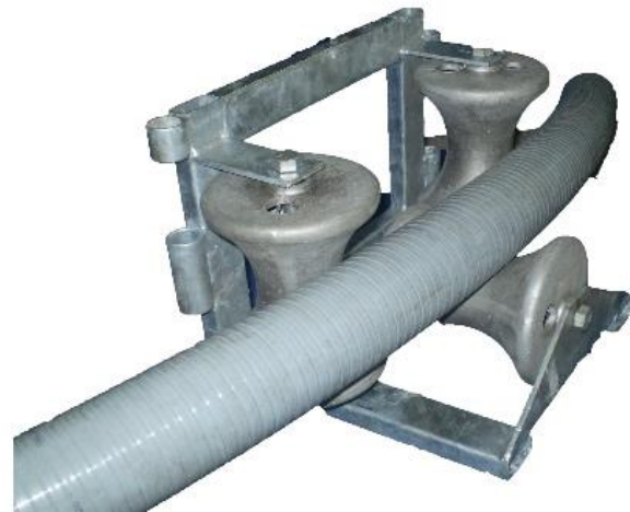
L-Shaped Dog Bone Rollers