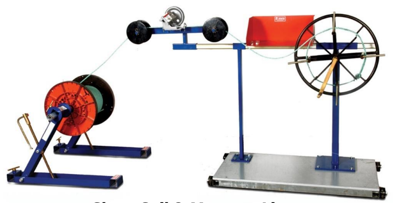
Short Coil & Measure Line

Web: www.phel.co.nz Ph: 0508 734 487 Email: sales@phel.co.nz