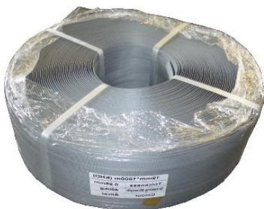
Grey Strapping Tape

Powerhowse Electric also supplies optional Polypropylene tape, which is strong, flexible, lightweight, and easy to use.