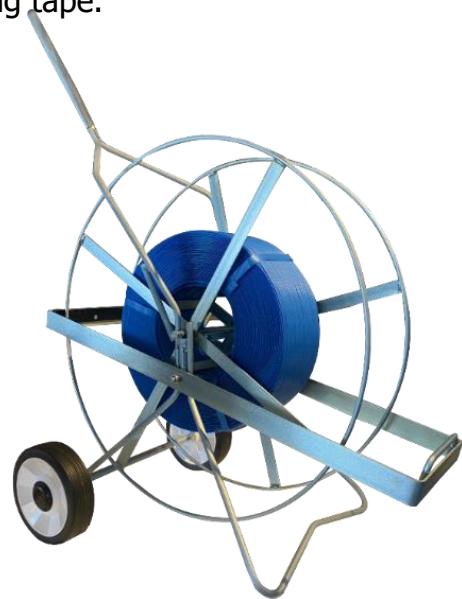
Tape Stand w/Wheels