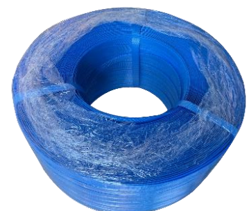
Blue Strapping Tape

Powerhowse Electric also supplies optional Polypropylene tape, which is strong, flexible, lightweight, and easy to use.